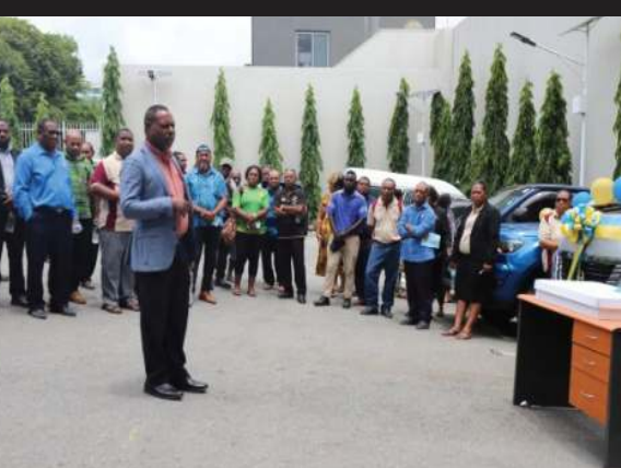
DCI Secretary doing his remarks at the launching of the two new buses.