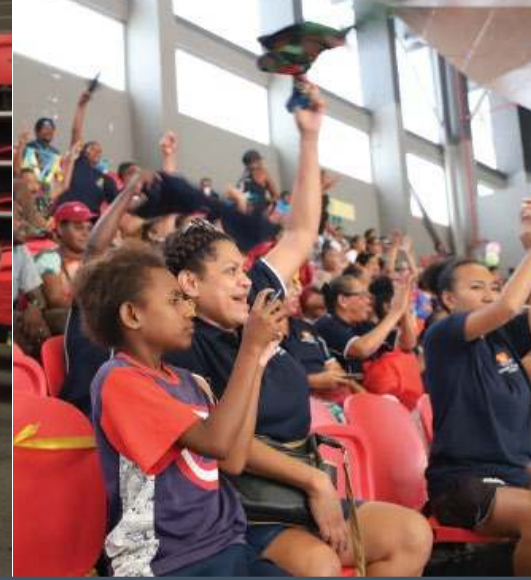
Department of Commerce and Industry netball team supporters at the Sir John Guise Indoor Complex.