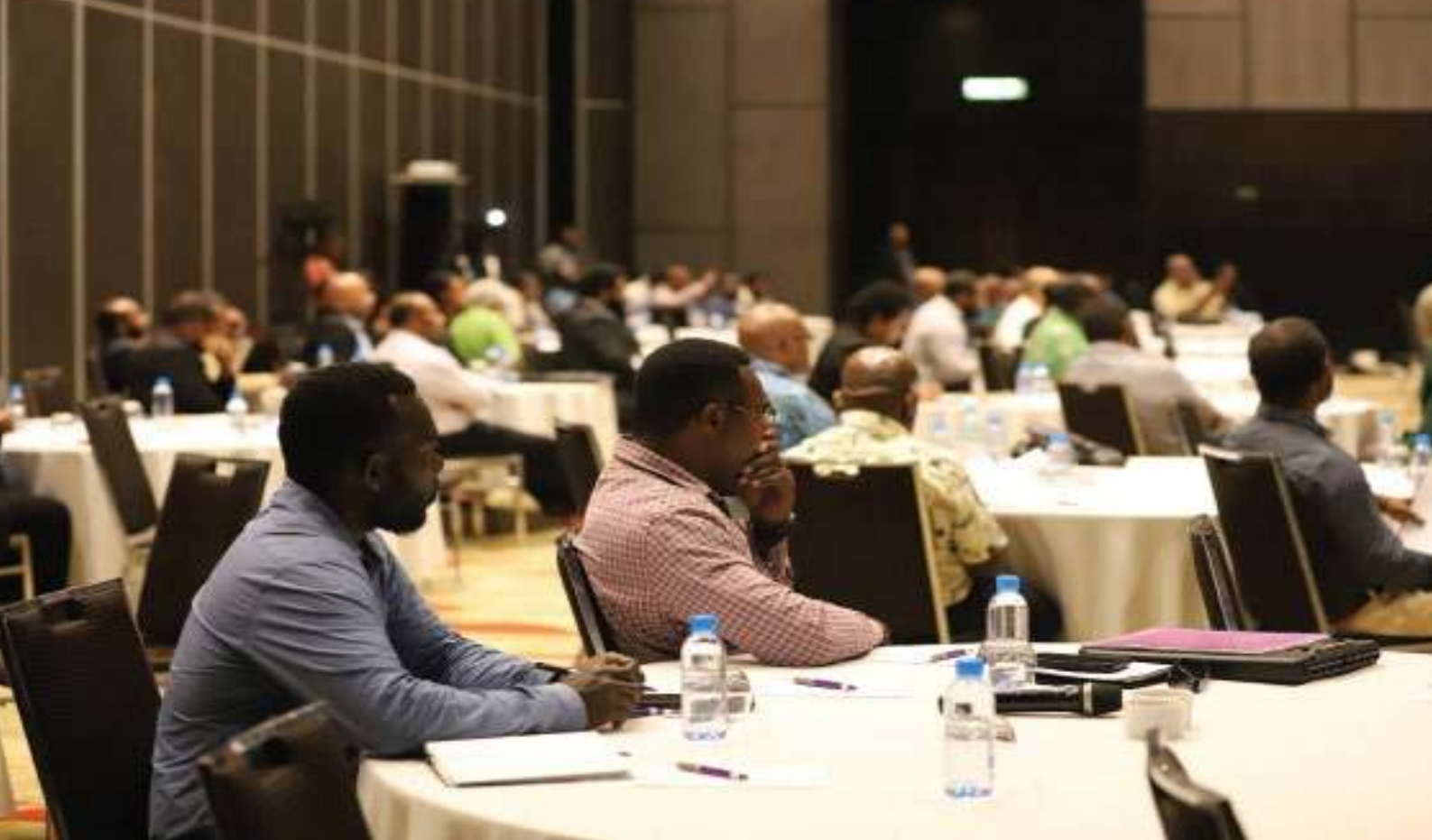
Discussions on the PNG Manufacturing Policy undertaking on July 3rd, 2023 in Port Moresby.