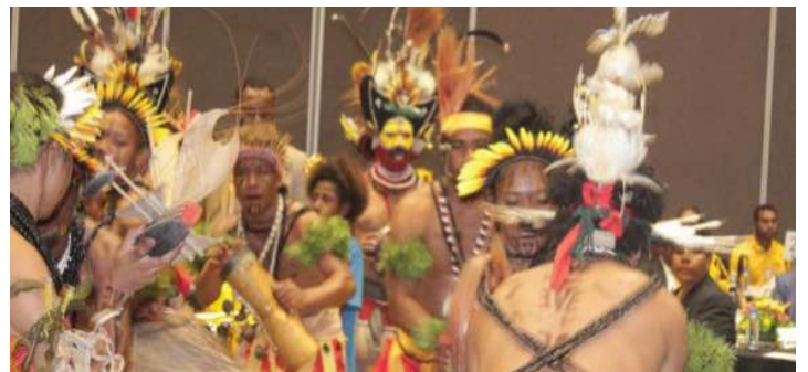
Dancers from Central Province at the Gold Bullion Policy launching in May, 2023.