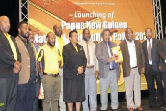
Department of Commerce and Industry Senior Management Committee members at the 2023 Gold Bullion Policy launching.