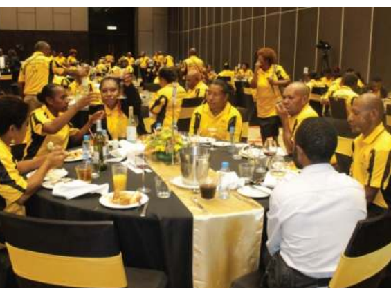
DCI staff at the 2023 Gold Bullion Policy launching.