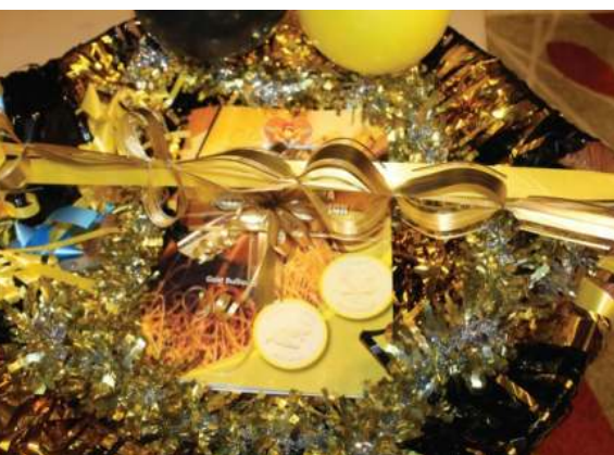
The decorated Gold Bullion Policy book.