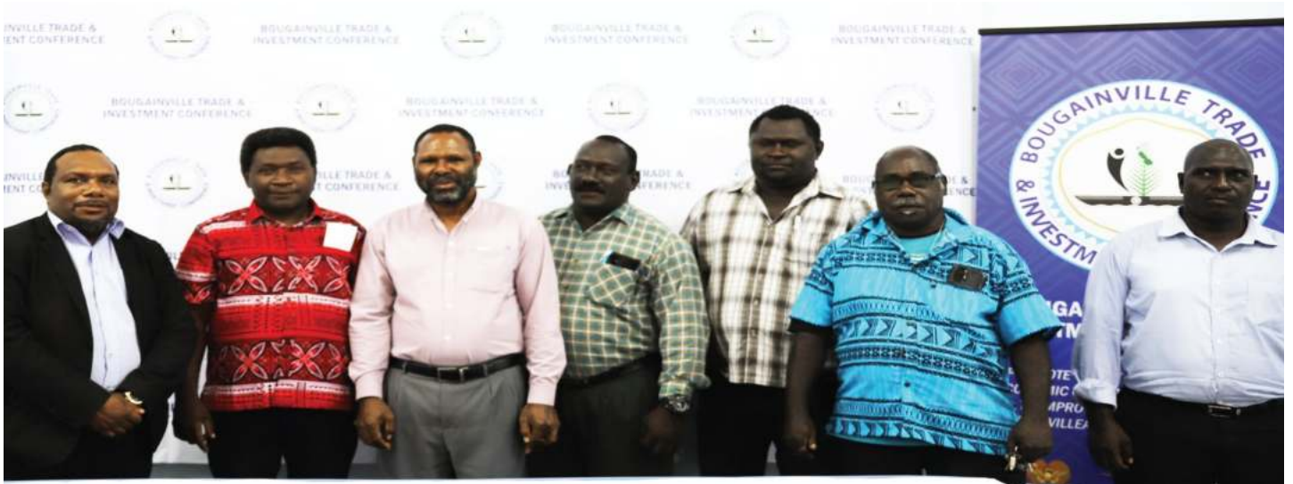
Bougainville trade and investment conference (BTIC) 2022.

PREPARATIONS for the Bougainville Economic and Investment Summit (BEIS) have begun in earnest following direction from the March 2019 Joint Supervisory Body (JSB) Meeting held in Port Moresby.