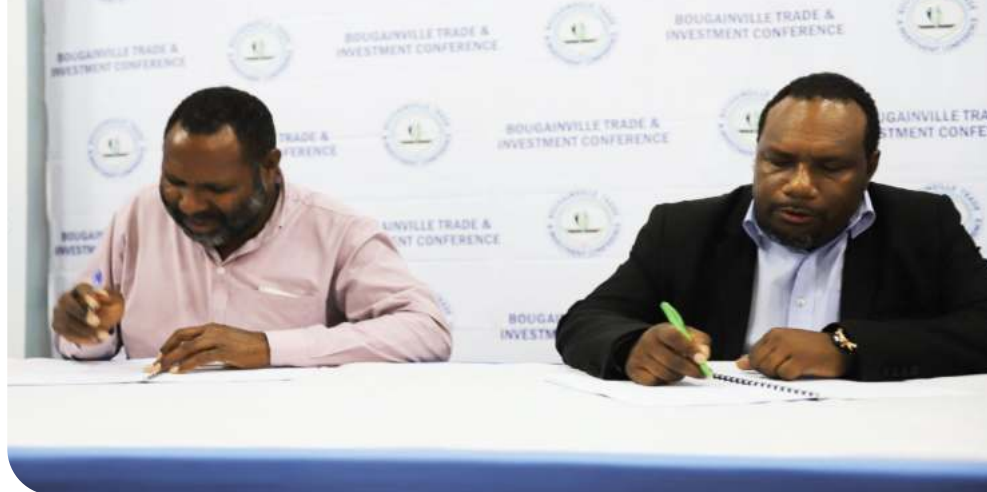
Signing of the MoU between National Department of Commerce and Industry and ABG Department of Trade, Commerce, Industry & Economic Development

Reports and acquittals are submitted quarterly to the Department of National Planning and Monitoring as part of its capital funding budget appropriation.