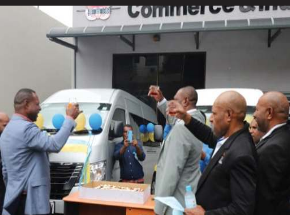
A toast for the two new 15-seater buses.