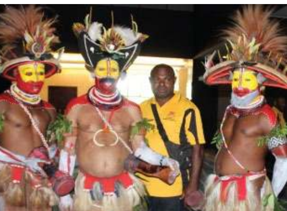
Hela dancers during the launching of the Gold Bullion Policy.

PRIME Minister James Marape has hailed the National Gold Bullion Policy (NGBP) as a positive step to lead commodity as far as the world of commerce, trade, and economics is concerned.