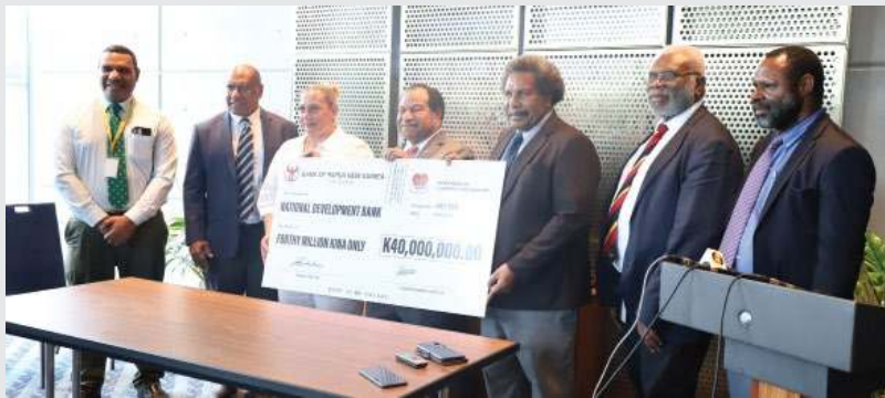
During the K40million presentation in March 2023, Port Moresby.

He emphasized the importance of inclusive growth and leaving no one behind, and said that the Government was planning to expand access to finance for SMEs at the lower end of the market chain.