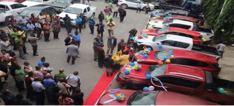
DCI staff gathering at the car park lot to witness the commissioning of the new vehicles.