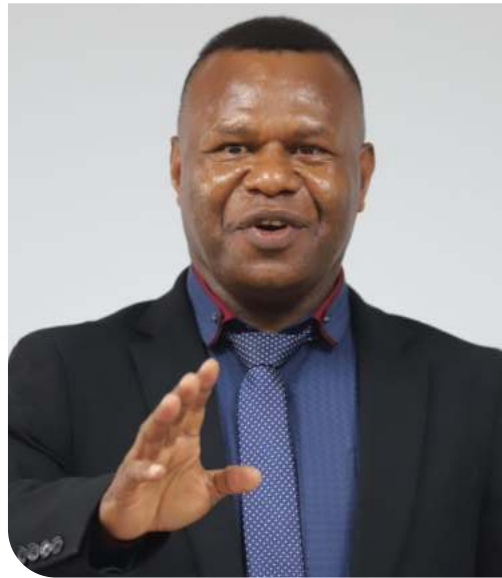
Minister for Commerce and Industry Hon. Henry Amuli (MP) speaking at PNG Community Affairs and National Content Conference and Expo Program in Lae, Morobe on Tuesday, 29th of August, 2023.

Amuli also proposed the creation of an oversight committee comprised of both the State and private sector peak bodies to manage the coordination and implementation of the PNG NCP. He emphasized the need