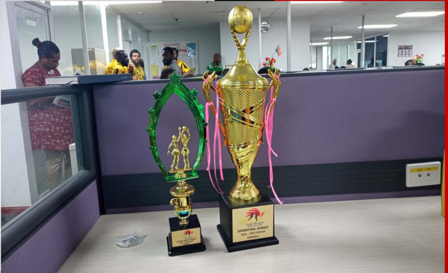
Photo above: The two trophies won by the DCI women's netball team, PSNA 2022/2023 season.

This newsletter is produced by the media team of the Department of Commerce and Industry