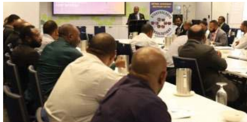
State agencies, private and other resource sectors at the draft National Content Policy in March 2023.